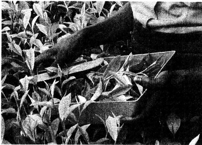
Figure 2. Proper way of holding the selective tea harvester